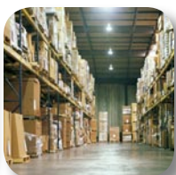
Warehouse / Storage