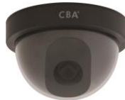
VD-20BNB (Uses 2x AA batteries)