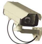
VD-10BN (Uses 2x AA batteries)