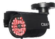
VD-30BNNAQ (Uses 2x AAA batteries)