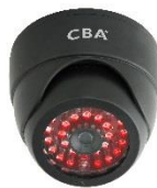
VD-20BNNAQ (Uses 2x AA batteries)