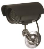
VD-30BS (Uses 2x AA batteries)