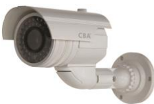
VD-30BNA (Uses 2x AA batteries)