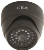
VD-20BN (Uses 2x AA batteries)