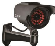
VD-30SS (Uses 2x rechargeable AA batteries)