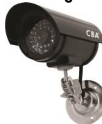
VD-10PL (Uses 12VDC power)