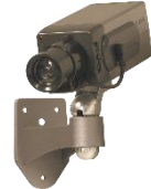
VD-10BNA (Uses 2x AAA batteries)