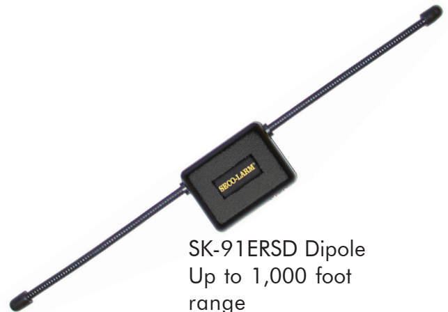
SK-91ERSD Dipole Up to 1,000 foot range