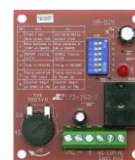
SA-025Q Multi-Purpose Programmable Timer