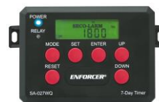
SA-027WQ 7-Day Timer