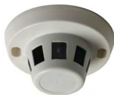
Covert Ceiling Mount Camera