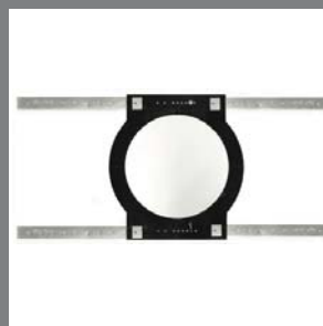
RIR-8 Rough-In Kit designed for sheet rock installations