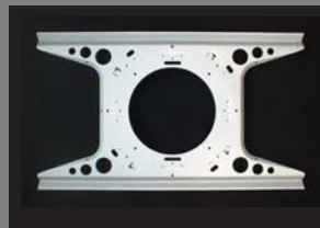
PB-8 T-Bar Bridge for reinforcing T-Bar Drop ceiling installations