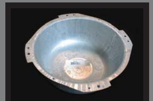
PE-8 Plenum Dome for use with PB-8