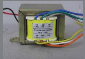
70 / 100 volt transformer