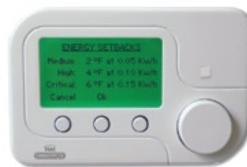
Displays Energy Setbacks for medium, high, and critical energy rates. These automatic temperature setbacks allow you to save money on energy bills if rates were to change.*