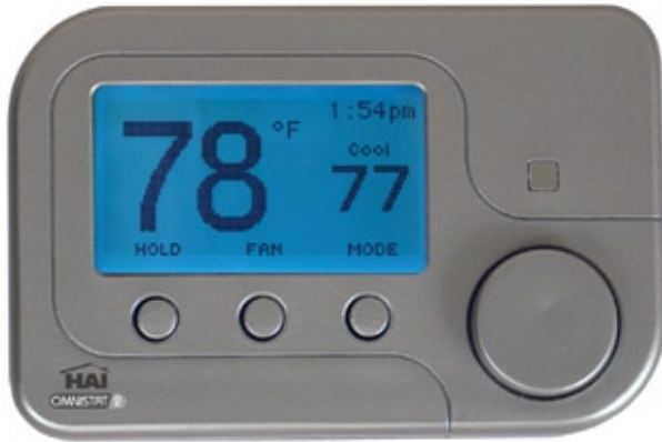
Silver Omnistat2 showing simple display and Blue backlight.