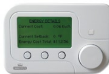
Displays Energy Details such as current cost as provided by your utility company.*

Advanced interaction between your home and your utility company can result in reduced energy usage and bills! Contact your local utility company to encourage their participation.