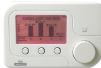
This graph allows you to monitor your Energy Cost, broken down by a specified time determined by your energy company.*