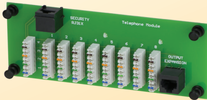
Part # 80-0070

DataComm Electronics proudly introduces a brand new lineup of Phone & Data Modules. These new products can be used in our new 14" Flush Mount Enclosure with Screw Cover (80-0014-SC) or any of our other enclosures.