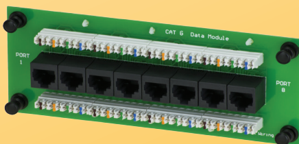
Part # 80-0040