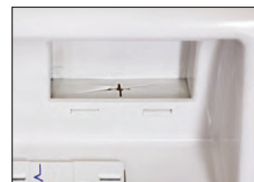
Flexible Screen closes interior opening of the Mid-Size Plate and Straight Blade Inlet