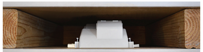
Top View - Mounted Between Studs