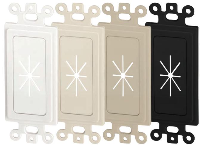
White Lite Almond Ivory Black