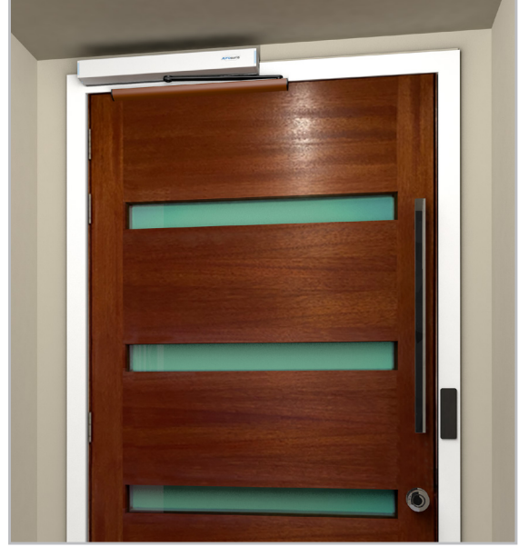
Door Set-up options