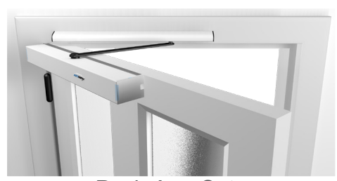
Push Arm Setup