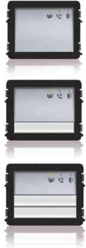
Fig. 1 – Terminal description