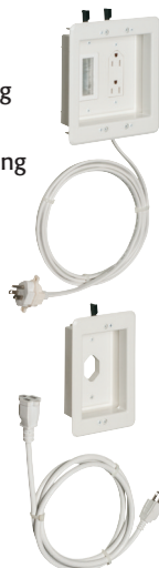
TVBR21K with two-gang upper box and single-gang lower box