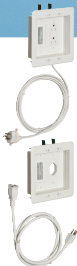
TVBR22K with TWO two-gang upper and lower mounting boxes