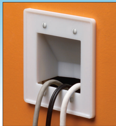
CE2 with SCOOP facing IN

For a video installation demonstration visit our website @ aifittings.com