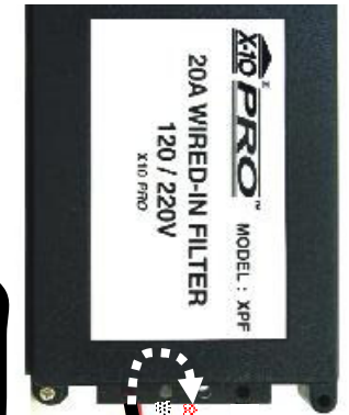
X10 Pro 20 Amp Noise Filter p/n XPXPF