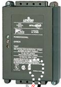
Leviton Coupler Repeater p/n LVHCA02