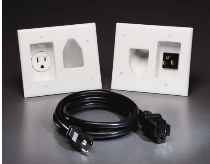
45-0021-WH Plate, 45-0023-WH Plate & 6 Ft. Straight Blade Extension Cord

Using the National Electrical Compliant approved installation, pull an approved 14/2 with ground or 12/2 with ground building wire cable from the installed Recessed Low Voltage Cable Plate with Power to the selected site in the equipment room. Install a new or old workbox before installing the Recessed Pro-Power Cable Plate with Straight Blade Inlet. This is a non-energized connection. To energize this connection, simply plug the supplied 6 ft. straight blade extension cord into the recessed straight blade inlet and plug the straight blade end of the extension cord into your rack mounted surge protector.